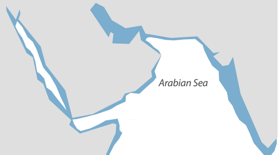
Anti-Piracy Planning Chart-Red Sea, Gulf of Aden, and Arabian Sea

The UKMTO is available via short code - 9715 or can be dialed directly at +971 50 552 3215